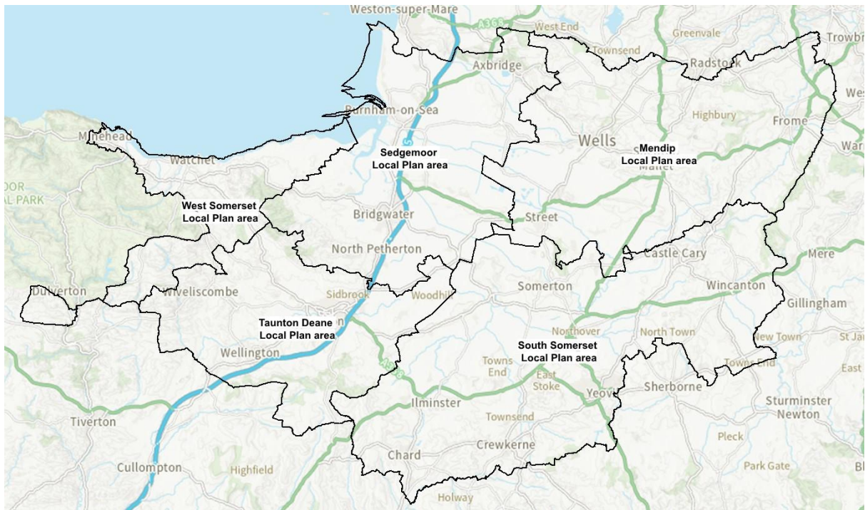
Table 1 lists the adopted Development Plan documents for Somerset Council. The documents can be viewed at https://www.somerset.gov.uk/planning-buildings-and-land/adopted-local-plans/

This means that the existing Development Plans of the former council's will remain in place for their relevant geographical areas of Somerset Council until they are replaced by one or more Development Plan documents.